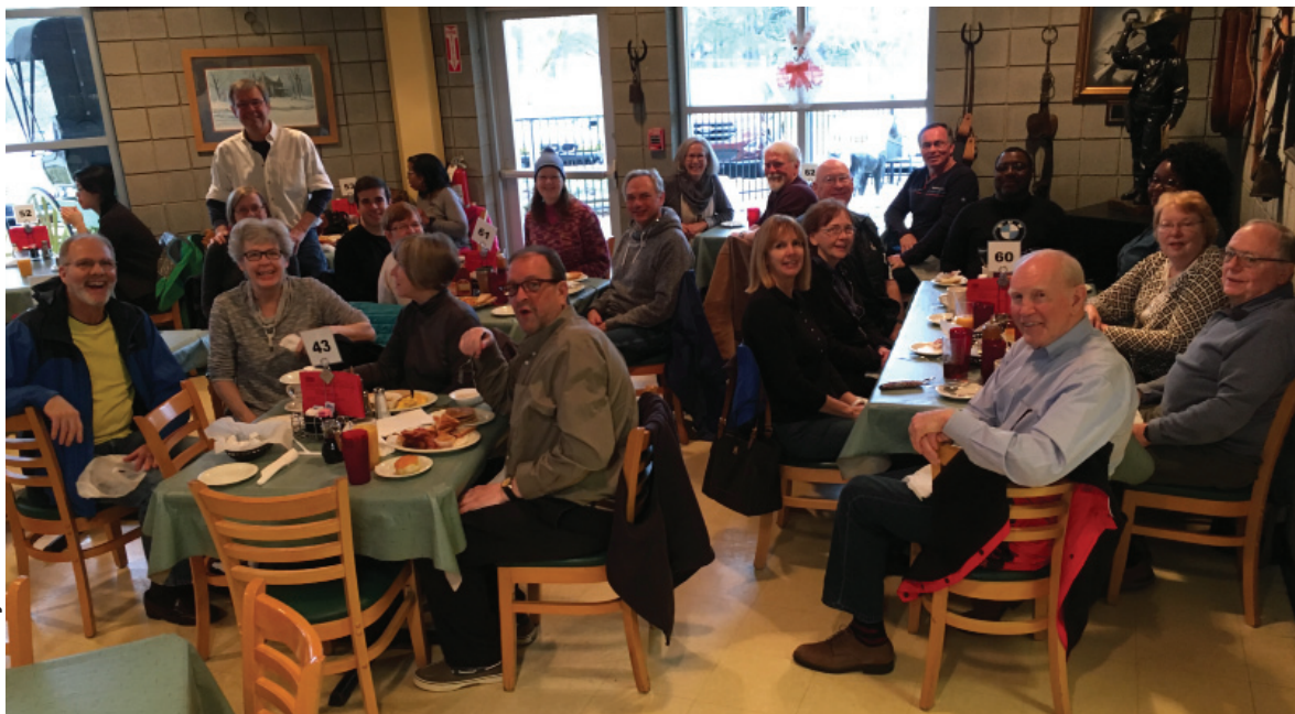
Great looking group from the "Morning After" Breakfast Run in Raleigh!