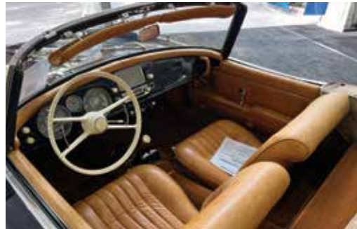
at The Amelia 2023

Answers to quiz: 1. C • 2. C • 3.B • 4. B • 5. D • 6. D • 7. A • 8. B • 9. E • 10. C