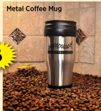
Metal Coffee Mug