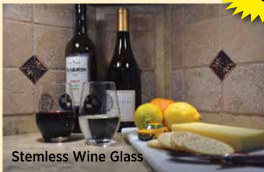
Stemless Wine Glass