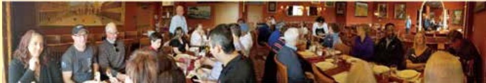
February 8, 2020 Williamsburg, VA

Our annual Valentine's Day Drive in Williamsburg always adjourns with an Italian feast!