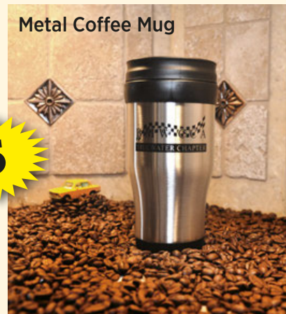
Metal Coffee Mug