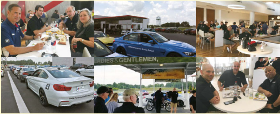
June 9, 2018 M Performance School, Greer, SC

Our intent is for you to recall events that you have participated in, remember the good times we shared, and to meet other members. Our Valentine's Drive is always a fun time and provides a great way to spend time with a loved one!