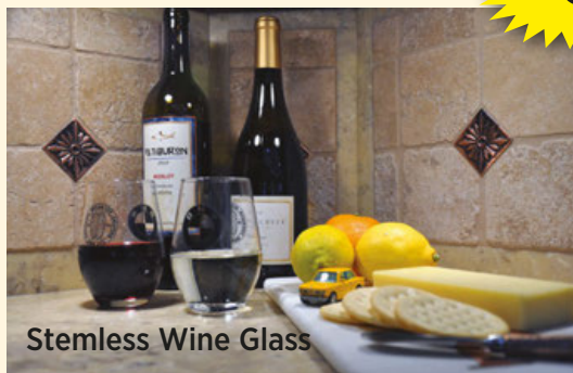
Stemless Wine Glass