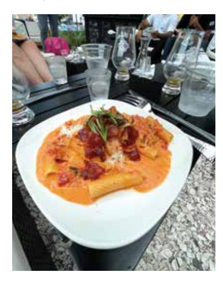
16 DAS KUMMET: Q4 2021

Each course was artfully conceived, fluently prepared, and beautifully presented. The most captious foodie would have found the experience both pleasantly educative and satisfying to their palate. There's an ethereal, hedonic pleasure that can be derived from enjoying a high-quality individualized meal. This experience delivered exactly that.