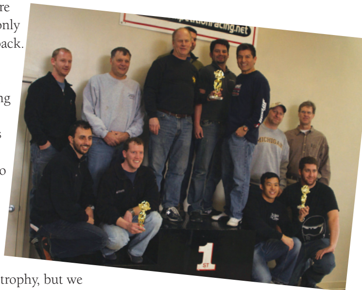
Go Kart Challenge