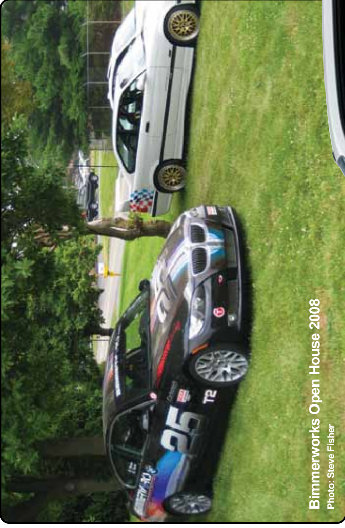
Bimmerworks Open House 2008

The terms BMW and MINI are registered trademarks of BMW AG. Bimmerworks LTD. has no affiliation with BMW AG or BMW NA. Use of the terms "BMW" and "MINI" are used for identification purposes only.