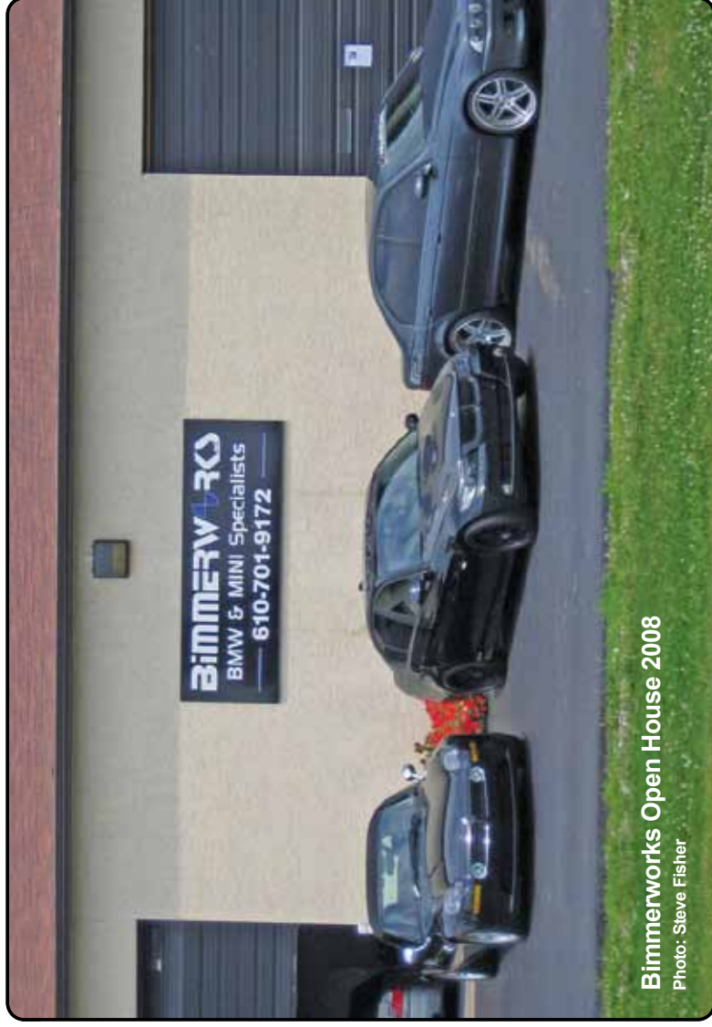
Bimmerworks Open House 2008

your ultimate BMW® and MINI® performance and maintenance facility