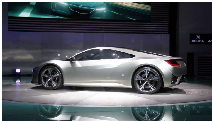
Acura NSX

In 2009, I mentioned how Acura shamelessly replicated an X6 with the introduction of their ZDX model. The ZDX is no longer in production due to poor sales; need I mention that the X6 is still going strong. This goes to show that brand can carry a model more so than styling.