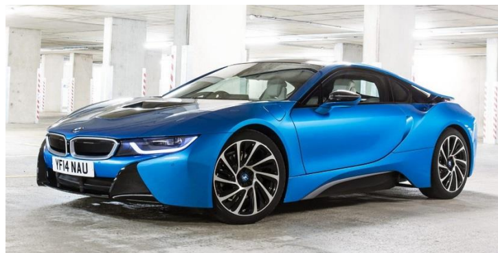
BMW i8

Don't get me wrong, I'm really not knocking Acura. I previously owned an Acura for over 8 years, and found that it was an extremely well built, problem free, high quality vehicle. It had a 3.2 liter VTEC engine that was as smooth as silk at lower rpm's, but literally screamed at higher rpm's. The car had 204,000 miles on it when I sold it, yet it had never flashed a check engine light, the engine was still leak free with zero oil consumption, and under the right circumstances, I might purchase one again. At one time, Acura had a certain styling individuality that set it apart from other car makes. It doesn't appear that is the case with all of their models. Acura will continue with a grand introduction of the NSX in 2016 and I'm sure that it will set high marks with its performance and build quality. Maybe no one else will really notice the similarities, but BMW owners around the world can smile with pride that the i8 was the style leader