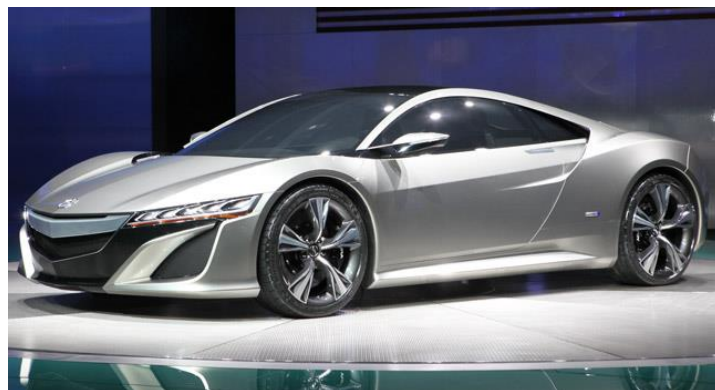
Acura NSX

What is the point of the Acura comparisons? Acura has recently revealed the upcoming release of the newly restyled 2 nd generation NSX. Not only is the new NSX a hybrid/electric like the i8, there is a more than coincidental styling similarity. Acura states that the NSX is the automotive industry's first supercar with a female design lead. A little bit of Google research reveals that the lead designer for the now defunct ZDX, (X6 knockoff), is the same person that is the design lead for the NSX. To be honest, I find this fact to be a little shocking, but you know the quote: Imitation is the sincerest form of flattery.