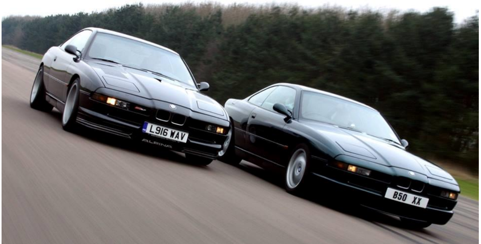
Alpina B12 5.7 and BMW 850CSi during high speed testing. BMW CAR Magazine

Who would have thought a BMW 8 could bring so much to our life.