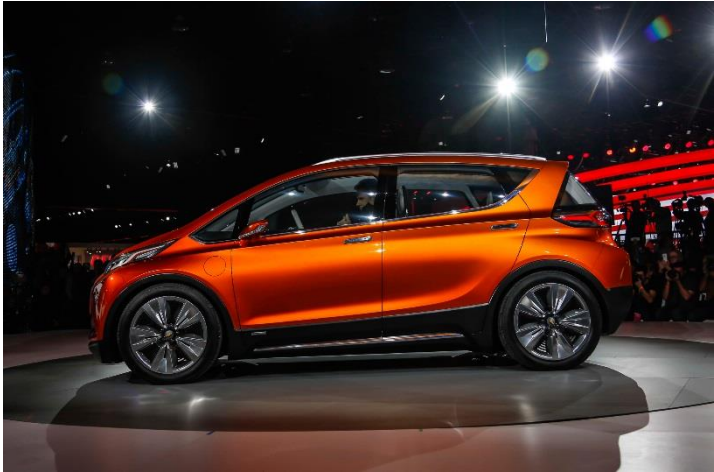
Chevrolet Bolt