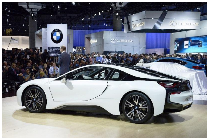
BMW i8

What is the point of the Acura comparisons? Acura has recently revealed the upcoming release of the newly restyled 2 nd generation NSX. Not only is the new NSX a hybrid/electric like the i8, there is a more than coincidental styling similarity. Acura states that the NSX is the automotive industry's first supercar with a female design lead. A little bit of Google research reveals that the lead designer for the now defunct ZDX, (X6 knockoff), is the same person that is the design lead for the NSX. To be honest, I find this fact to be a little shocking, but you know the quote: Imitation is the sincerest form of flattery.