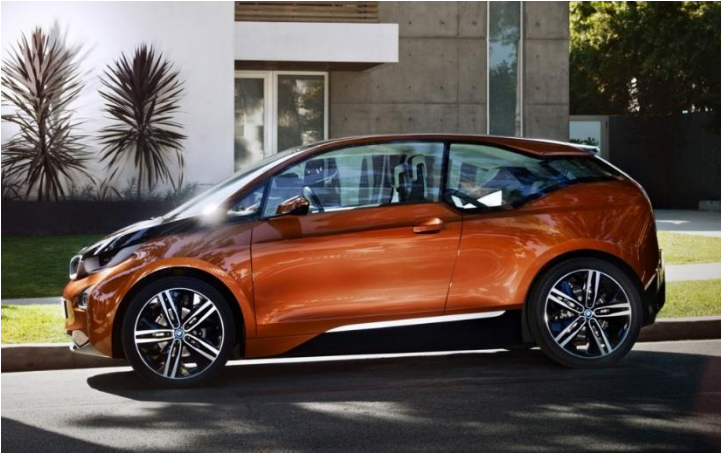
BMW i3 - Photo credit – bizbeatblog.dallasnews.com

On the other non-supercar end of the spectrum, BMW introduced the i3. The i3 can be considered a fully electric vehicle geared toward local use due to its limited 80 mile range, (without range extender). It has an advanced carbon fiber/aluminum structure which sets it apart from most any other vehicle. It also features a utilitarian and somewhat whimsical design that makes it both functional and stylistically unique, for the time being that is. Again, BMW has become a fashion/style leader because the i3 is already being mimicked. Chevrolet is currently displaying their concept vehicle named the “Bolt”. Chevrolet recently pre-viewed this vehicle and has stated that they are committed to future production of this vehicle. Like the i3, the Bolt will be a fully electric vehicle. Again, you can say that imitation is flattery. Take a look at these photo comparisons and judge for yourself and remember, the BMW you drive today, whether it’s be new or old, was/is a style leader in the automotive community.