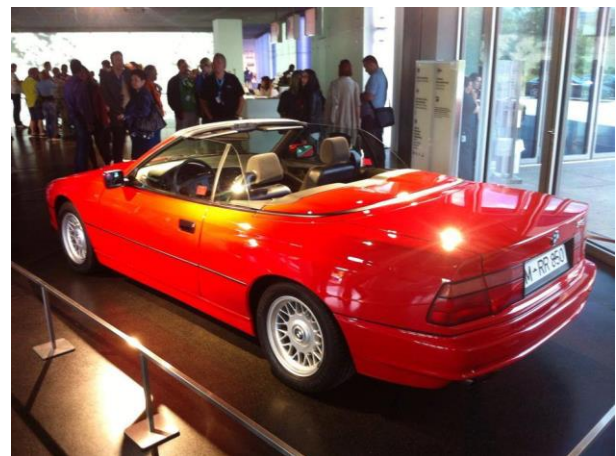
BMW 8 Series Convertible Prototype displayed at the BMW Factory during the 25 th Anniversary of the E31, Munich, Germany.