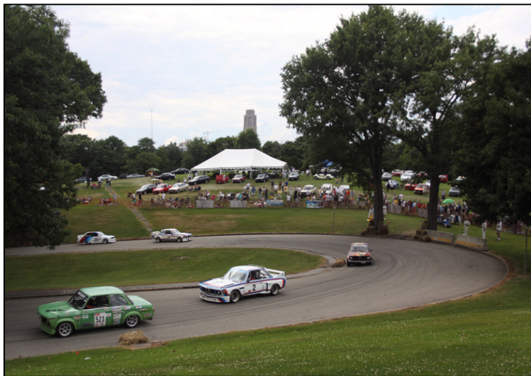
At the Pittsburgh Grand Prix, you'll see old-school road racing at Schenley Park.

You won't want to miss the annual BMW Gathering at the Pittsburgh Vintage Grand Prix (PVGP) scheduled for July 16–25 and sponsored by Liberty Mutual Insurance and the BMW CCA.