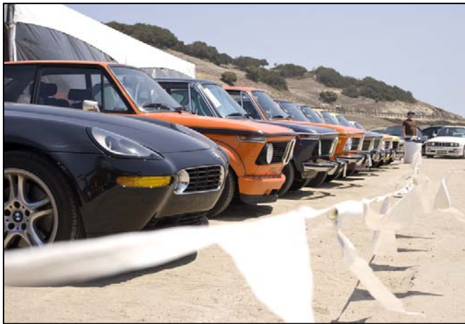
The historic races at Monterey always draw a huge BMW crowd to watch the action above Turn Five. (Jeff Cowan)

Also sponsored by Liberty Mutual Insurance and the BMW CCA, the annual BMW CCA