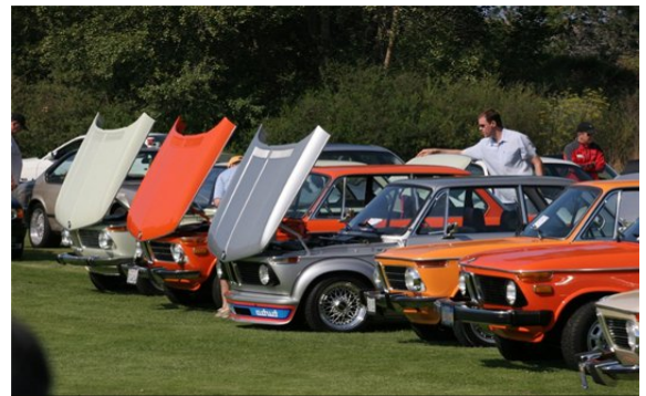
This year the BMW CCA West Coast Summer Concours has been expanded, with Porsche and Mercedes-Benz joining us in Monterey.

On-line registration for this event is open via each respective club's website, where you may register your car and pre-order lunches and event T-shirts. All registrations will be handled online. For additional information, please visit www.cccbmwcca.org or www.summerconcours.org .