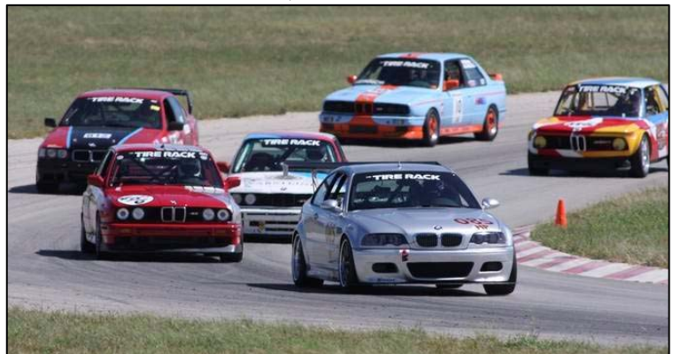
Club Racing has become a popular O’Fest event.