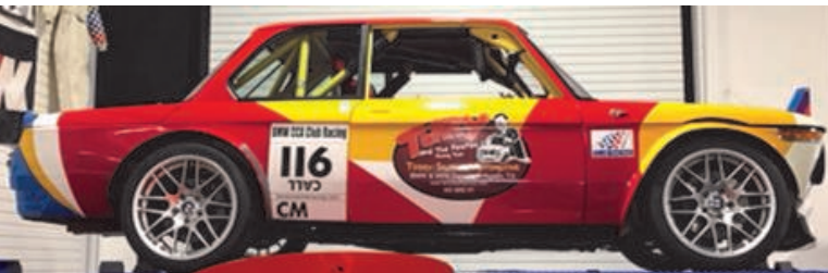
(Continued on page 10)

Over time, the museum has either acquired or accepted on loan, a wonderful collection of BMW cars, artwork, brochures, and memorabilia, basically anything BMW-related, but it was not until last year that they took on the task of their first major exhibit, Heroes of Bavaria .